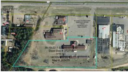
Just off State Rd 70 in Grantsburg.