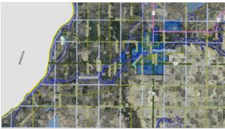
Area overview. Highway 70 connects Minnesota and Wisconsin at the St. Croix River bridge.