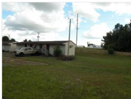
Property located on edge of Village of Grantsburg. Pleasant rural backdrop off the edge of the property.