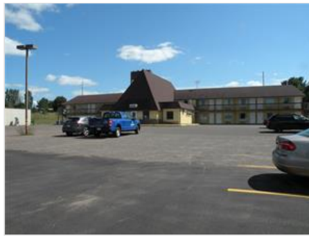
Grantsburg Inn. Parking next to motel and in parking lot.