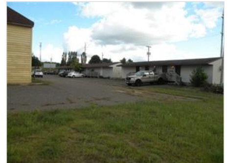
6 Apartments provide Longer term rentals.