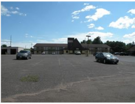
Grantsburg Inn, Laundromat & Car Wash