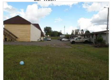
Back of Motel. Apartments are just across the driveway. Convenient for management.