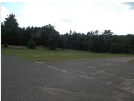
Undeveloped portion of the property. Future expansion space.