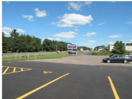
Sign on State Rd 70. Property is located on a high traffic highway in the business corridor.