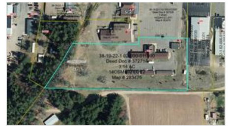
Adjacent to rural property. Map from Burnett County web site.