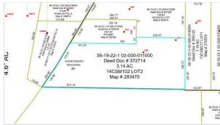
Lot dimensions. Map from Burnett County web site