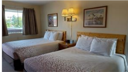
Motel has Generous rooms with 2 Queen Beds