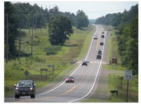
High traffic State Rd 70. Grantsburg Inn is only 15 miles from Interstate 35