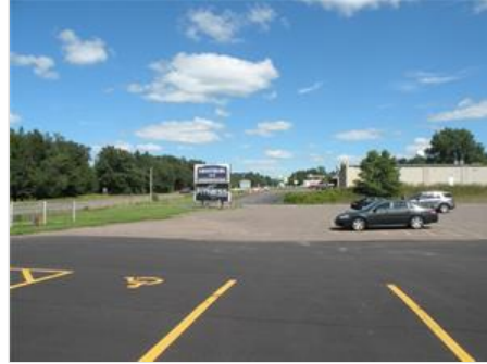
Sign on Hwy 70. Business corridor.