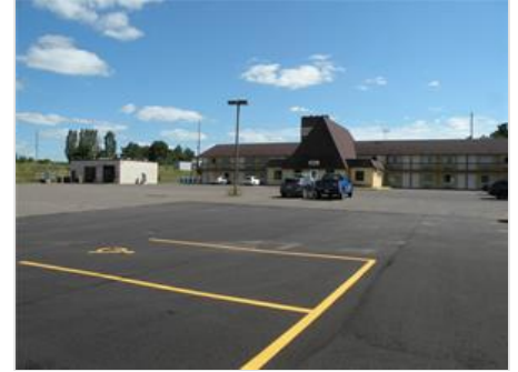
Looking across the parking lot at Grantsburg Inn